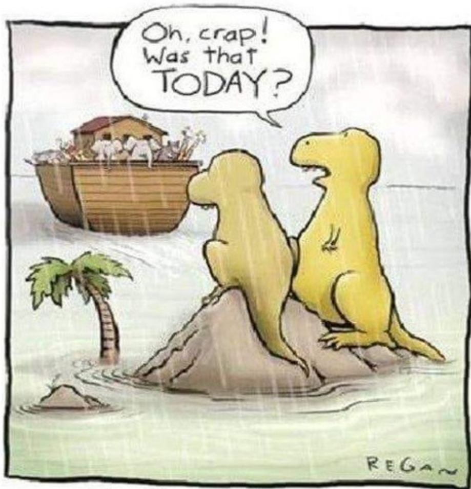
The first senior moment.